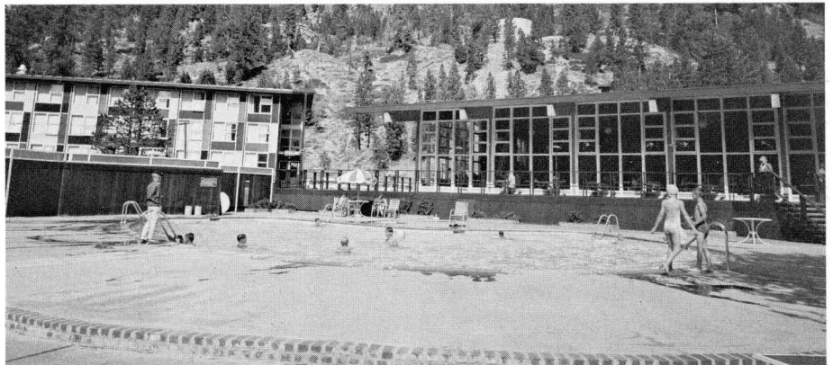
ABOVE—The heated swimming pool by the side of the cafeteria is a spot for happy children.

Order and cooperation were evident throughout the day which continues to be the keynote of any gathering of God's people.